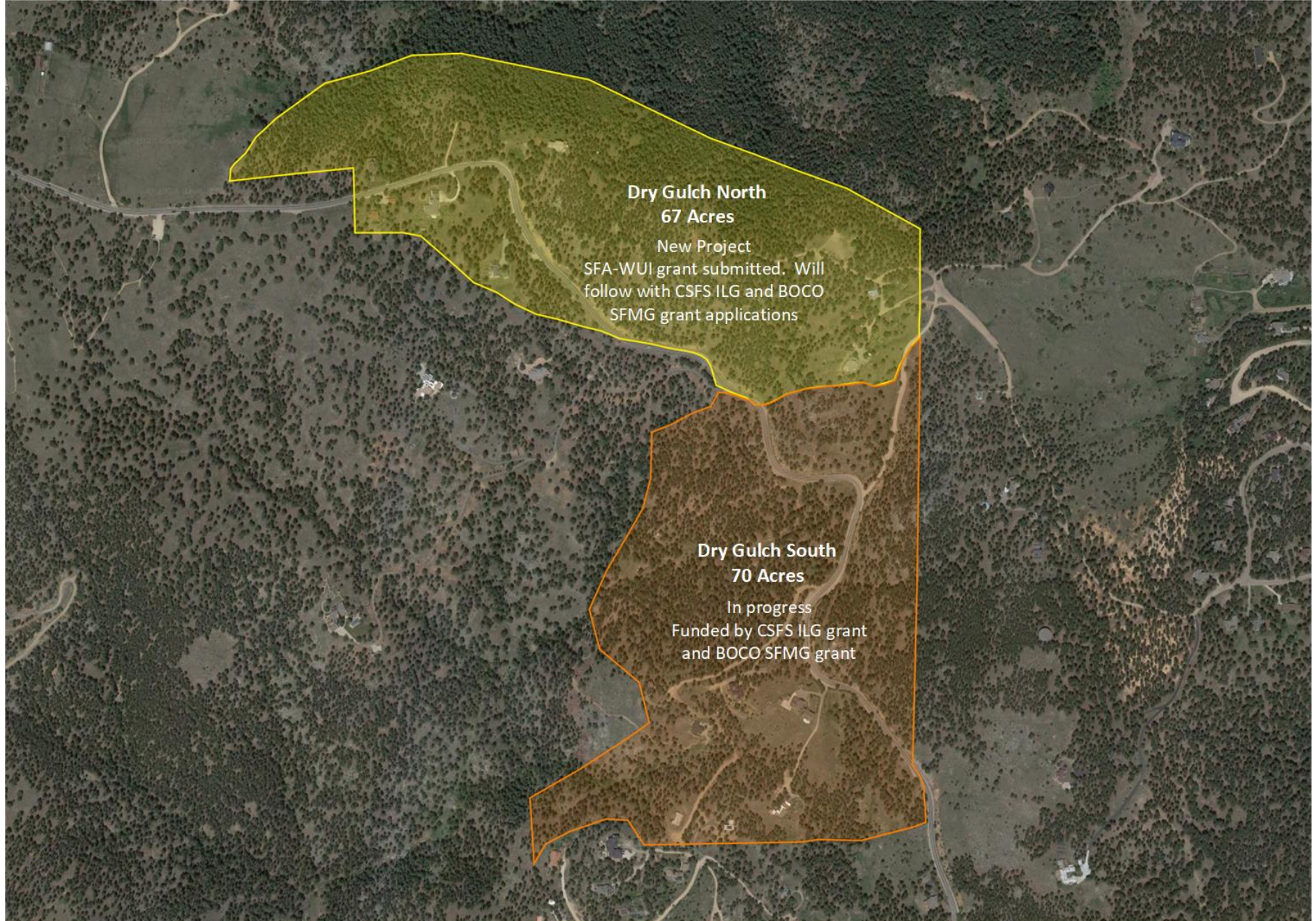
Dry Gulch South and Dry Gulch North Fuels Reduction Projects