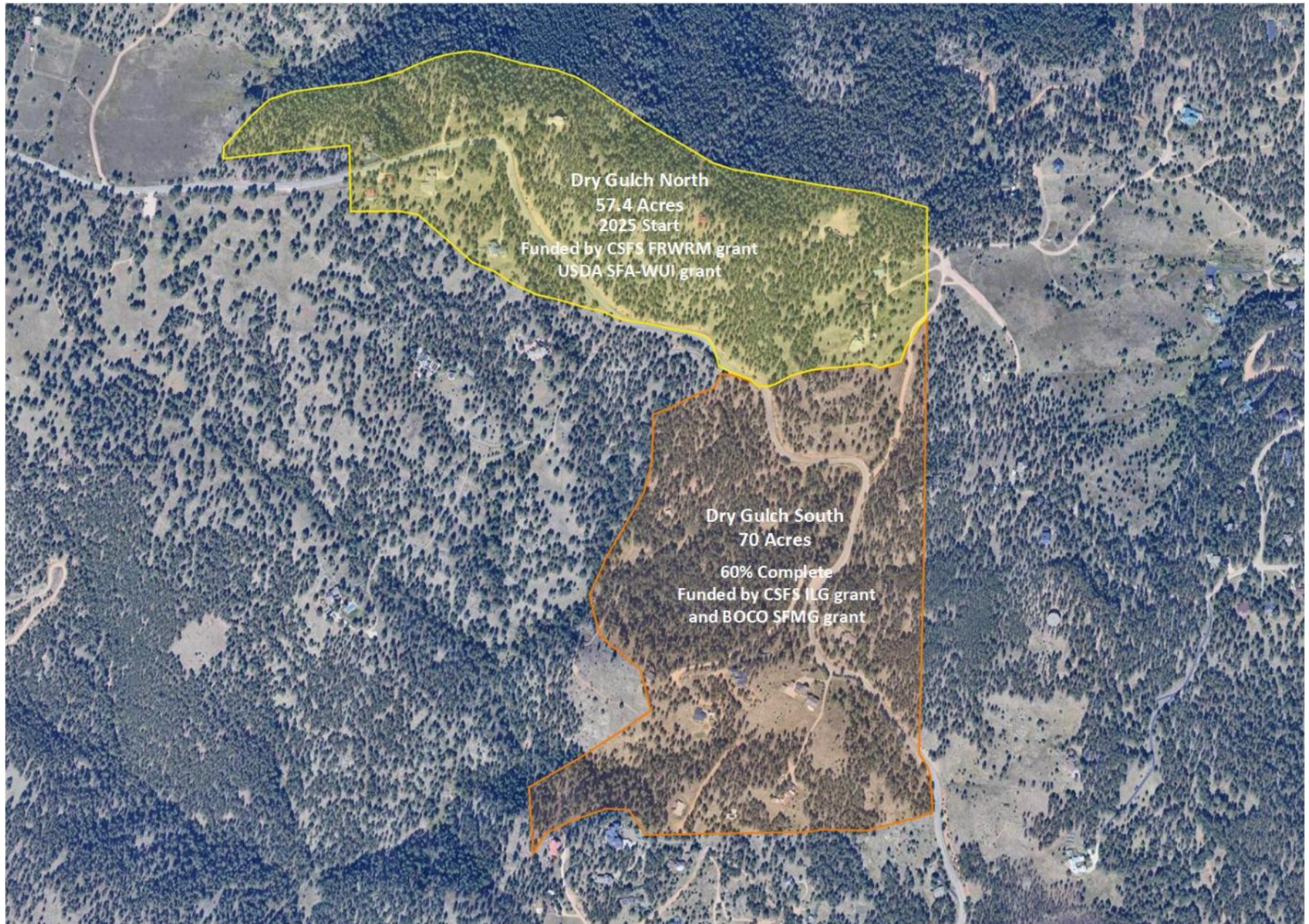
Dry Gulch North and South Fuels Reduction Projects