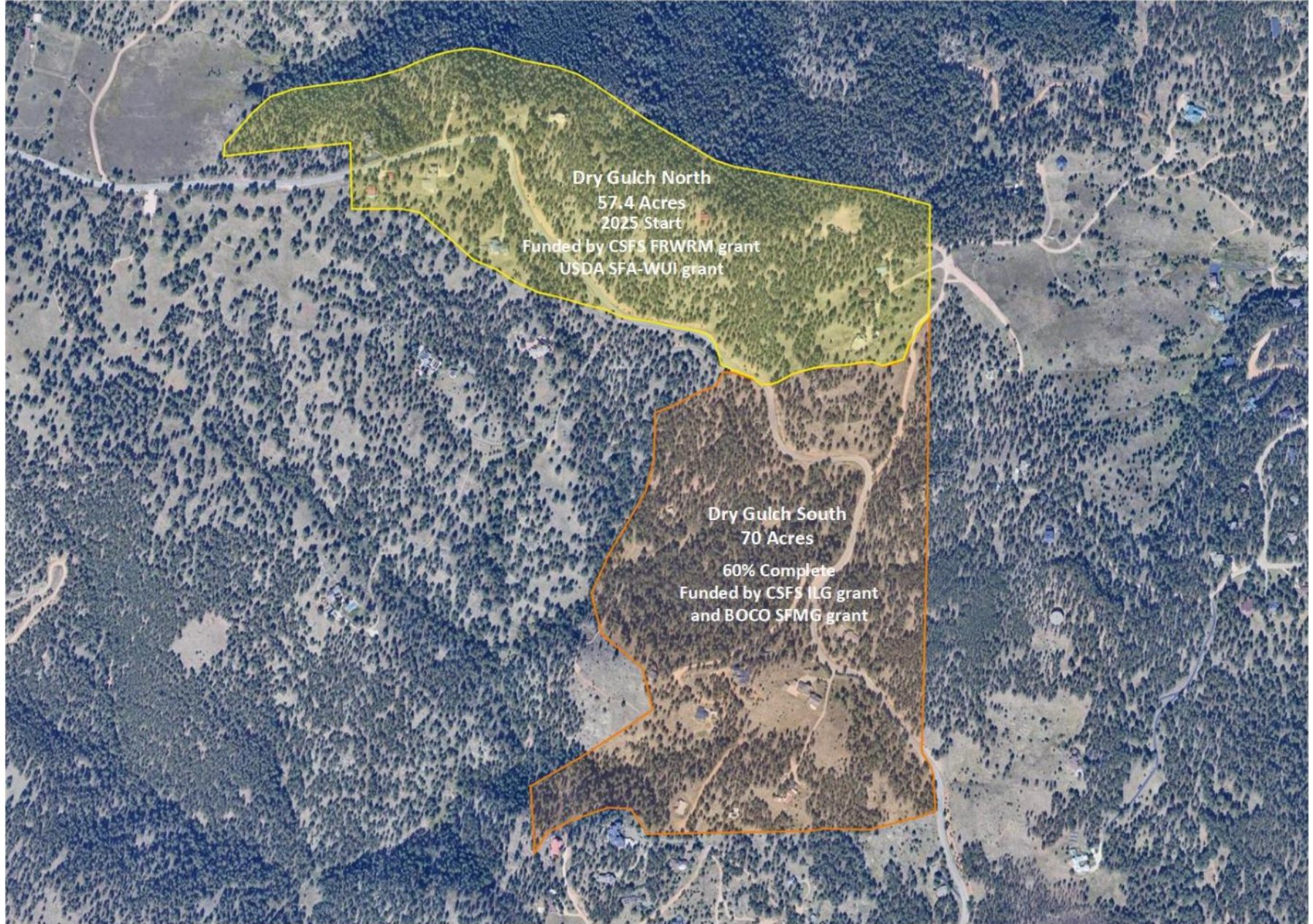
Dry Gulch North and South Fuels Reduction Projects